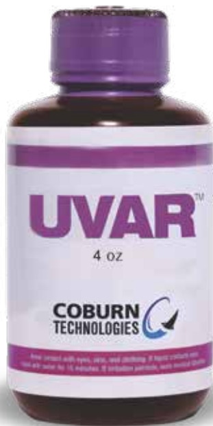
Part No. 21-1001