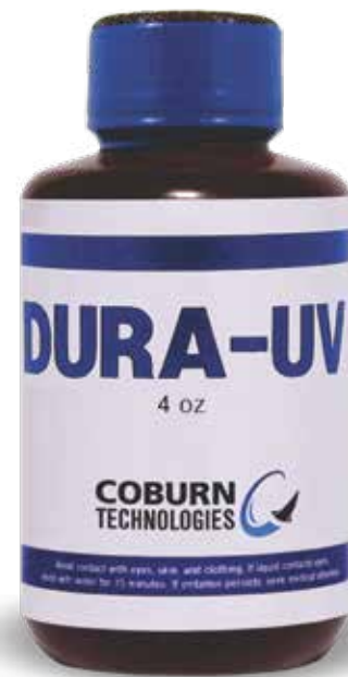
Part No. 21-1020

Coburn develops and manufactures their coating solutions at their research and development facility in Boca Raton, FL. All coatings are premium quality with only the best of raw materials and are produced with an unsurpassed, inline quality control process.