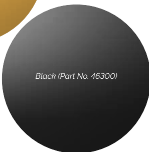
Black (Part No. 46300)