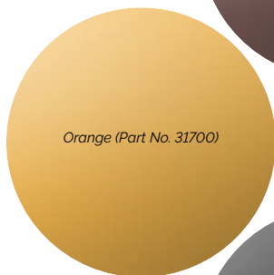
Orange (Part No. 31700)