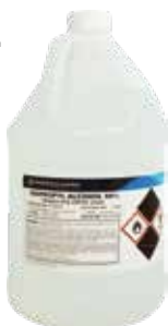
Part No. 8320600

Anti-static and wetting agents added to purified and filtered isopropanol alcohol. Prevents dust particle build up and promotes a more even flow and distribution when cleaning a lens surface prior to coating.