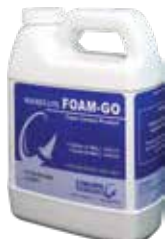
Part No. 46260

Rocket-Lite Foam-Go is a highly effective foam control product specifically suited for lens washing slurries.