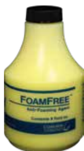
Part No. 163782

Concentrated solutions for use in lens washing equipment. FreeWash assists in the removal of wax, polishing residue and markings. Use in conjunction with FoamFree defoamer to minimize foaming.