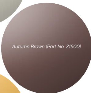
Autumn Brown (Part No. 21500)