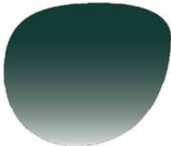
G-15 Dry Tint (Part No. C250-15)

OptiSafe® lens dye packets have been formulated by Phantom Research Laboratories, Inc. after several years of research and development. They are the most advanced lens dyes available today, providing the most consistent, uniform colors in the least amount of time. The molecular composition of the dyes allow for rapid penetration into the lens matrix, bonding to the lens and providing an excellent resistance to fading. Plastic CR-39™ (coated and uncoated), Hi-Index, and Polycarbonate lenses can be successfully tinted with OptiSafe® lens dyes.