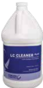
Part No. 8342670

Used in conjunction with Hyperclean towels, LC Cleaner PLUS provides superior pre-cleaning of lenses prior to coating.