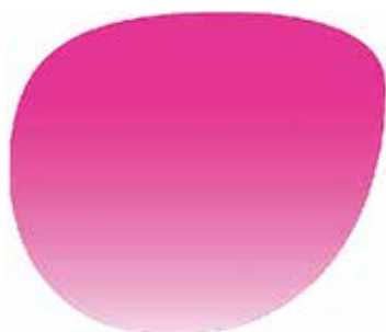
Rubine Dry Tint (Part No. C250-83)