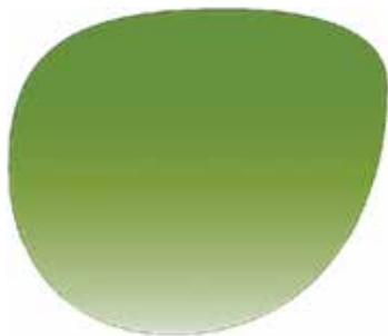
Green Dry Tint (Part No. C250-70)