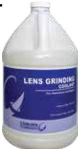
Part No. 8019370

Coburn's lens grind coolant is a general purpose, water-based concentrate for generating and edging.