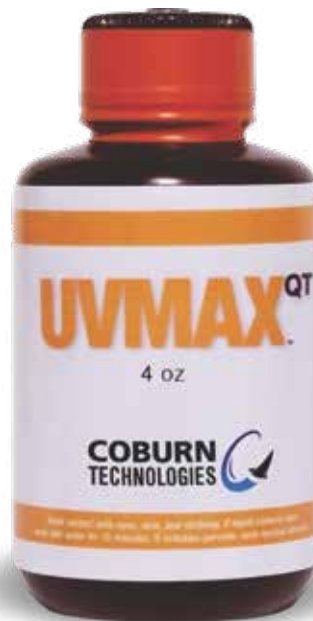
Part No. 21-1016