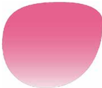
Pink Dry Tint (Part No. C250-50)